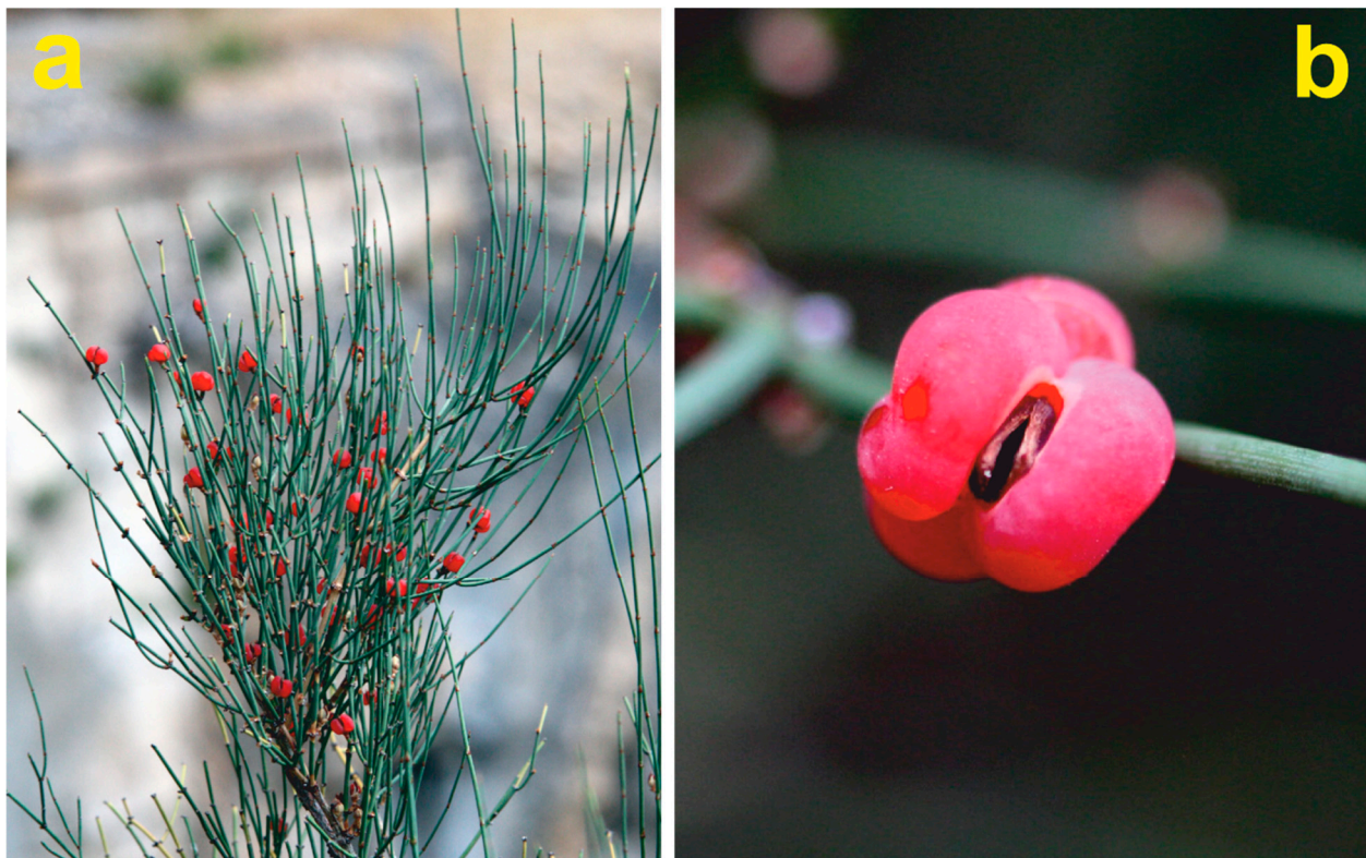
Figure 2. (a) Ramet of Ephedra major displaying many strobili in the mast year 2008; (b) Strobilus close-up showing two inner seeds.

The E. major individuals from the study site were observed at least once a year between 2007 and 2019 to monitor their development, dynamics, vegetative spread, and seed set. During the monitoring period, few berry-like cones were produced only occasionally, except for the mast year 2008. In July of that year, many well-developed strobili were observed (Figure 2a).