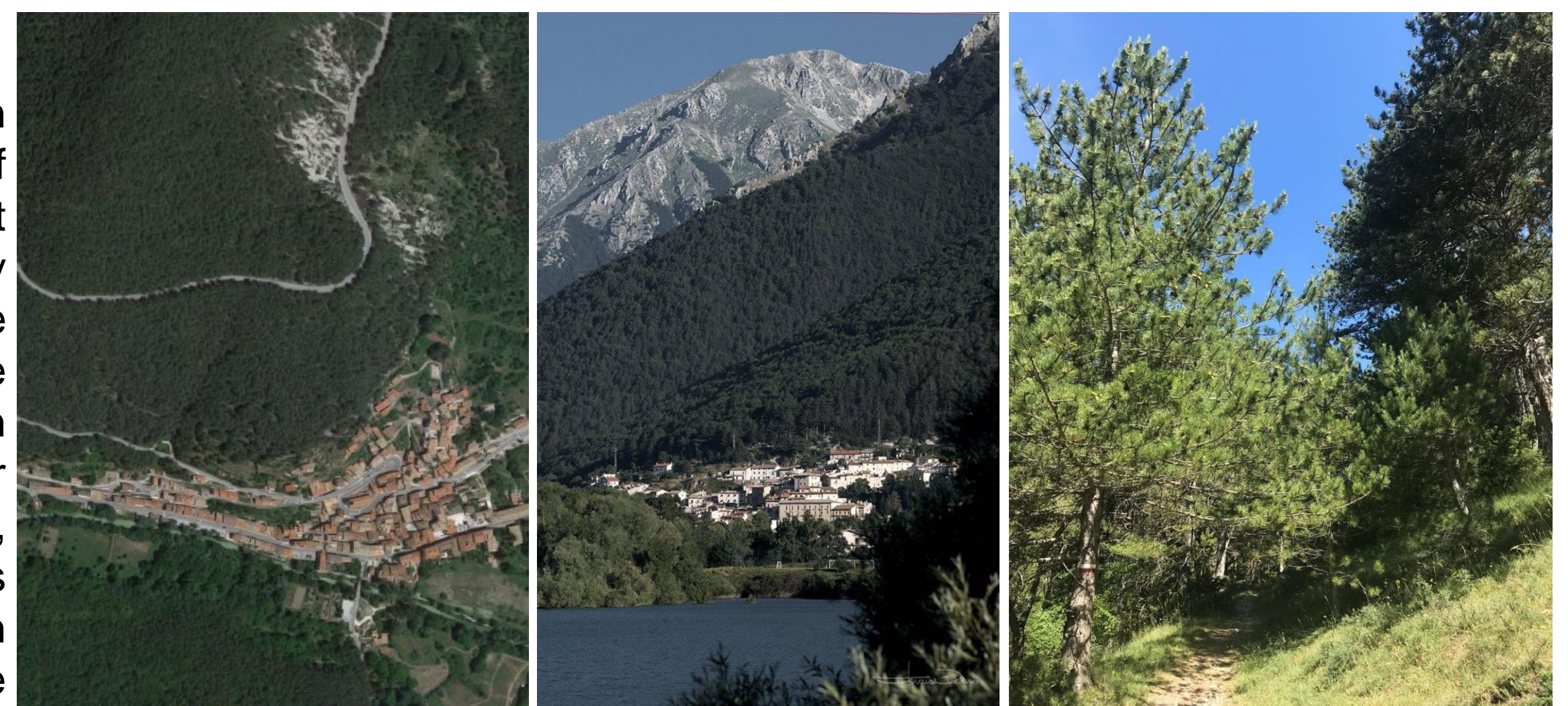
Fig. 3 Villetta Barrea pine forest

2. Pineta di Villetta Barrea (Abruzzo region): This pine forest, of great phytogeographic and biogenetic value as it is made up of Pinus nigra var. italica , is included in the integral protection area of the National Park of Abruzzo, Lazio and Molise (Fig.3). Even here, despite the harsh opposition of a local committee of citizens, supported by numerous exponents of the scientific world, it is proposed to thin out the pine forest in order to prevent any fires which, in memory of man, never happened in that area. The particular insistence with which the presidency and above all the management of the Park support this project is perplexing as it is difficult to exclude a logical connection with the construction of a small biomass power plant in the Municipality of Pescasseroli, in the center of the park, and with the economic development of the territory falling within the park which, according to the director, can no longer be based solely on tourism, but must provide for a forestry chain for the production of timber. The dispute has not yet ended with the parties involved who are currently remaining on their positions.