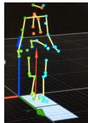
Fig 2: Qualysis motion acquisition